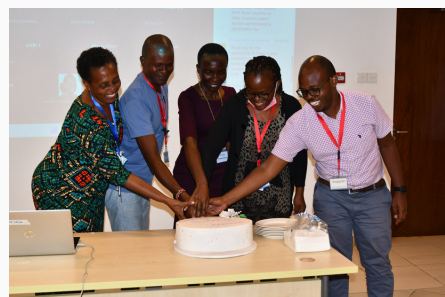
Community and project team members cutting cake during the launch in Kilifi, Kenya.

In this issue, meet our vibrant team and the communities that we have engaged, and have already started working with towards achieving our ambitious health targets. We look forward to continued engagement with all our stakeholders and your contribution to our overall objective. Hope you enjoy the read!